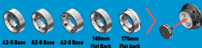
A2-5 Base A2-6 Base A2-8 Base 140mm Flat Back 170mm Flat Back